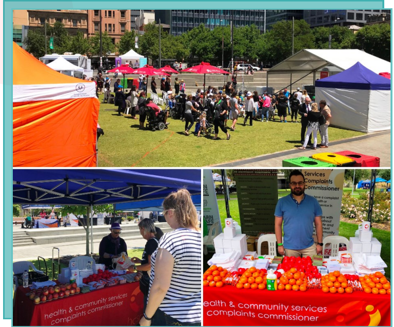
HCSCC staff at Celebrate on the Square (top, left) and Feast Festival (right).

The HCSCC is aiming to extend its reach during 2019 and if you have any suggestion about where we should be, please email us and let us know.