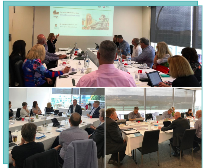
The Australia and New Zealand Disability Complaints Commissioners (top, right) and the Australian and New Zealand Health Complaints Commissioners (left).

The Conferences are held twice a year and rotate between the States and Territories of Australia and New Zealand.